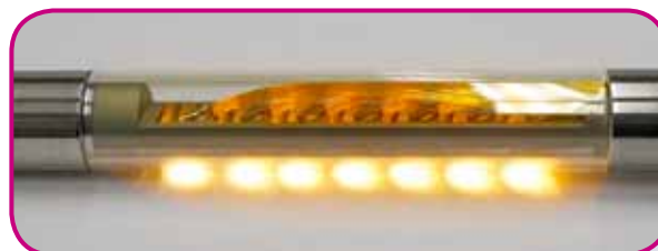
Each of the seven measurement spot covers an area with a diameter of 5 mm.

The qualification of the SentroProbe DR MS 7 NIR is supported by certified standards and custom designed standard holders. This results in a robust system validation routine and calibration in compliance with pharmacopeia requirements such as USP<1119> or EP 2.2.40.