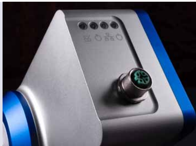
Compact display and connection panel

The SentroPAT Compact is operated by our SentroSuite GMP software which can be installed on a dedicated PC or on any PC in the network. Many features of SentroSuite GMP software comply with commonly required aspects of 21CFR part 11 regulations. Additionally, the system can be controlled by third party interfaces such as SIPAT, SynTQ or ProaXesS.